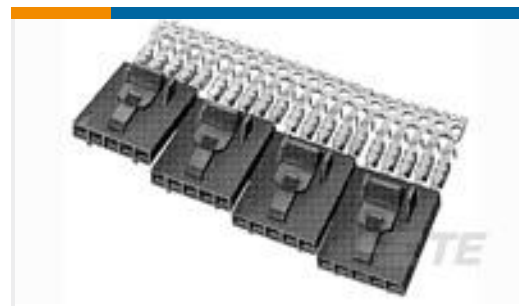
TE Part # 5-103957-3 5X4 MTE RCPT SR LATCH .100CL