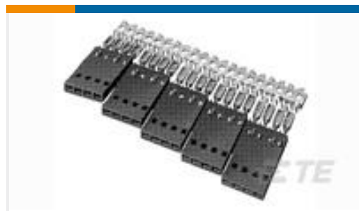
TE Part # 5-103972-3 5X4 MTE RCPT SR RIBBED .100CL