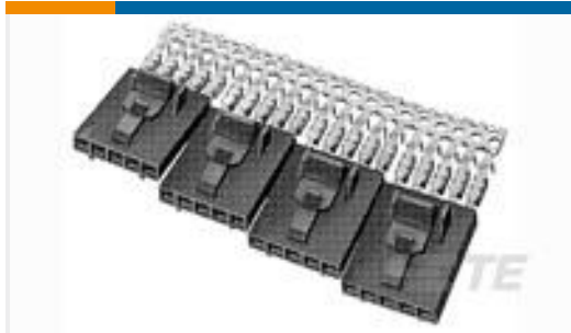
TE Part # 1571142-2 5X4 MTE RCPT SR LATCH .100CL