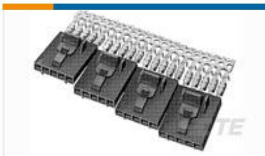
TE Part # 5-103960-3 5X4 MTE RCPT SR LATCH .100CL