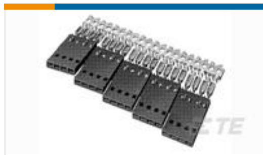
TE Part # 5-103969-3 5X4 MTE RCPT SR RIBBED .100CL